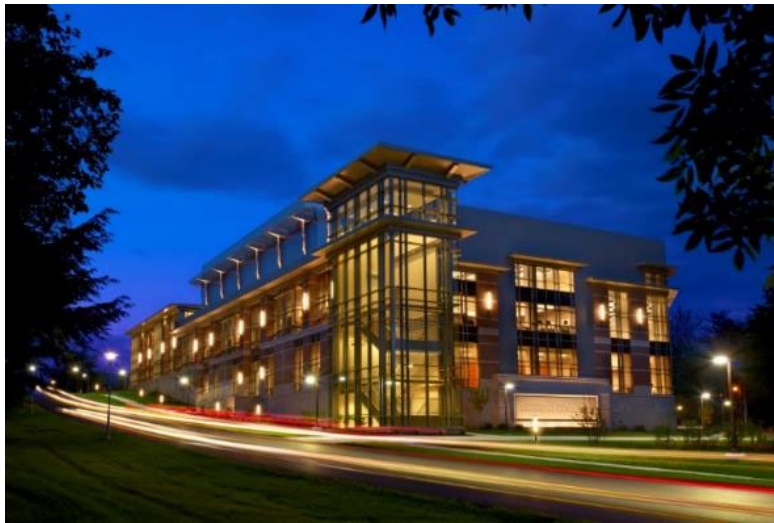
Calvin and Janet High Center for Worship and Performing Arts

In the opinion of the University, there has been no material adverse change in the financial condition of the University since June 30, 2019, the most recent date for which audited financial statements are available.