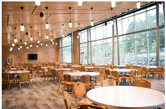
Martin Dining Commons