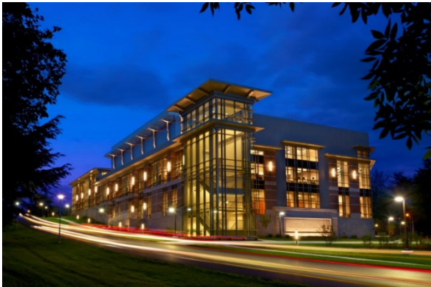
Calvin and Janet High Center for Worship and Performing Arts

In 2013 the University opened its new Calvin and Janet High Center for Worship and Performing Arts, which was funded entirely with gifts and internal funds. During the past five years, the University raised 100% of the funding for its new artificial turf field for lacrosse and soccer, as well as the Martin Dining Commons, a 4,800 square foot addition to the University's dining hall. The University is proud of its ability to successfully raise funds for project specific facilities as needs arise. Although Messiah recently celebrated its 100 th anniversary in 2009, 80% of its alumni (living & deceased) graduated during the most recent thirty years. The University has been the recipient of many generous contributions from both alumni and a greater community of friends despite its youth.