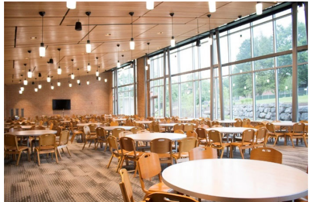
Martin Dining Commons