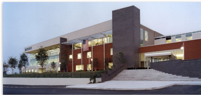
Location of Graduate Health Science Programs

Approximately ten years ago, the University began to strategically contemplate the addition of key graduate programs which would complement Messiah's niches and build on its long-standing academic strengths. Now ten years strong, graduate programs have witnessed steady growth and are an important addition to the University's revenues. The following information summarizes the growth of Messiah graduate activities.