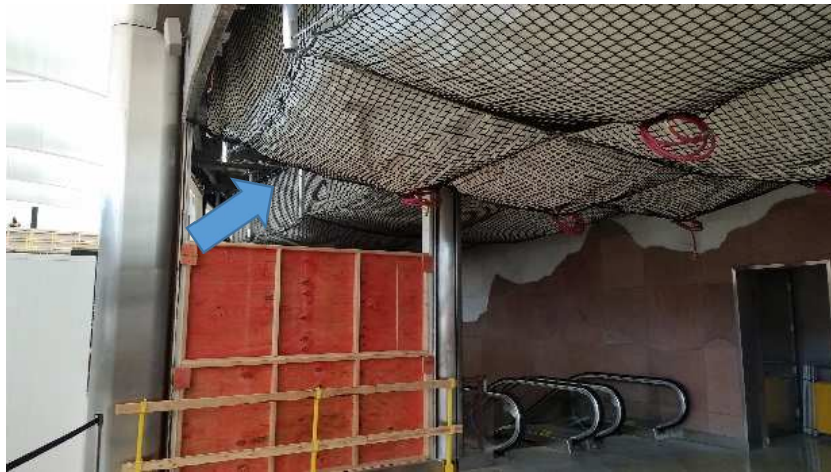
AGTS netting installation prior to overhead slab demolition. (Looking north, 02/27/19)

Throughout February, work continued to demolish the edge of the northern bridge, at the north end of the Mod 2 Plaza. The concrete slab was removed, followed by the steel structure, and finally, a railing was constructed along the new slab edge, to allow the bridge to re-open again, for full passenger use.