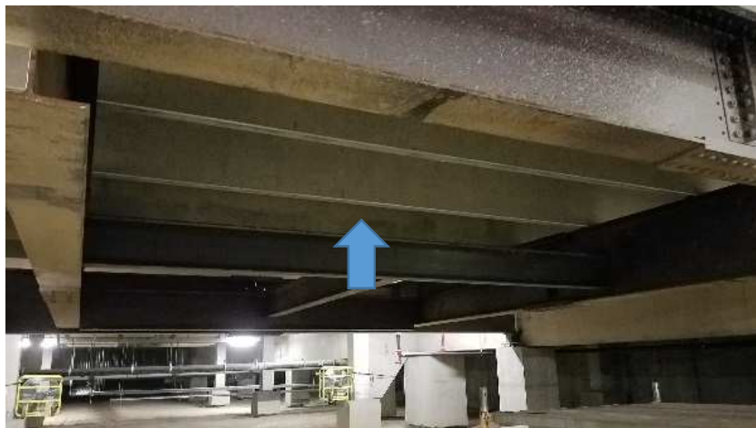
L3 crawl space with new steel beams erected for the south escalator pits. (02/21/19)

New escalator installation continues with the mounting of large steel members to support the equipment on Level 4, of the AGTS. This work will continue for several months as the trades coordinate their crafts with the AGTS schedule and nearby passengers.