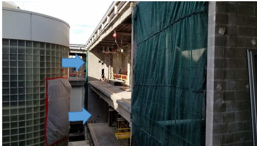
L5/6 west, curtain wall demolition, glass and steel framing removed. The western side is completed, and work will move to the eastern side. (Looking north, 02/28/19)

On level 6, demolition has continued concerning the layer of topping grout throughout the work area. The grout slab needs to be removed and replaced before the new flooring installation.