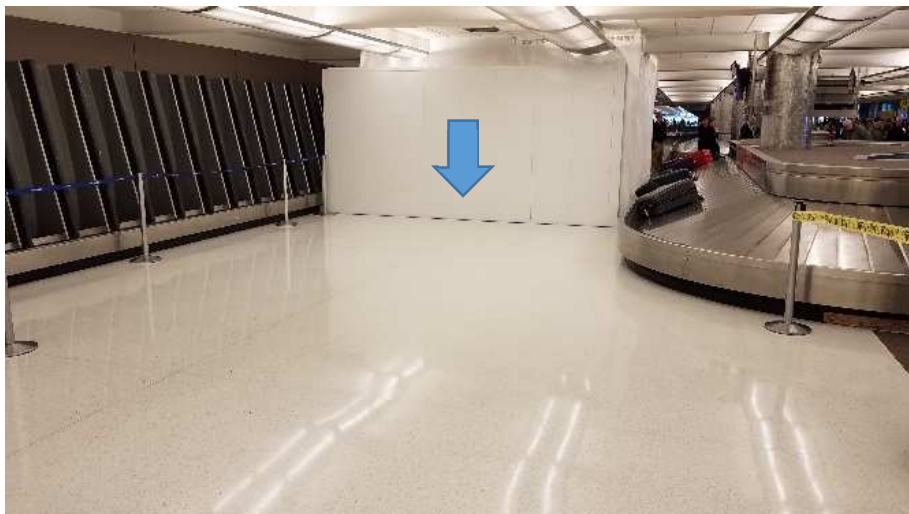
L5 west, baggage claim terrazzo flooring. Flooring is completed and open for public use. Arrow indicates the walls for the next sequence of terrazzo work. (Looking south, 02/25/19)

In the baggage claim area of level 5, the new terrazzo flooring work progressed in several locations. On the western side, the first portion of the terrazzo was completed, opened for public use. Terrazzo work is now progressing into a second sequence of terrazzo on the western side and continuing in a more substantial sequence on the eastern side.