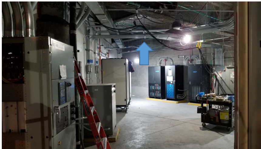
CMF IT room overhead electrical. (02/21/19)

Work in the CMF continued with concentration electrical elements and wiring throughout the space. Conduit rough-in to the electrical room is ongoing, and sub-contractors continued installing wiring and conduit throughout the CMF space.